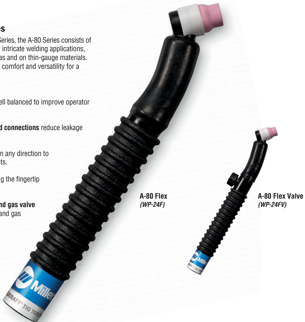
A-80 Flex (WP-24F)

Note: Torches delivered may vary slightly from images shown.