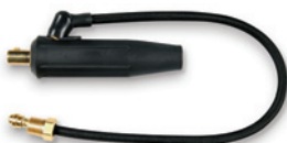
195378 50 mm Dinse-style for one-piece air-cooled torch.