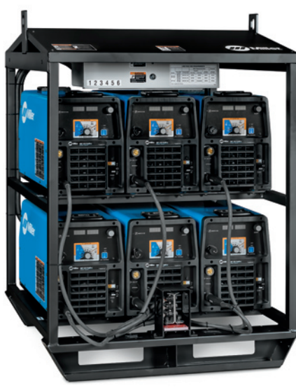
XMT 350 FieldPro 6-Pack Rack shown.