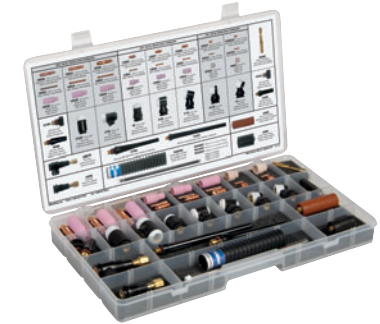
TIG Torch Accessory Kit AK-150MFC

TIG/Multitask Gloves 263352 Small 263353 Medium 263354 Large 263355 X-Large Goat grain leather with dual-padded palm and wool back.