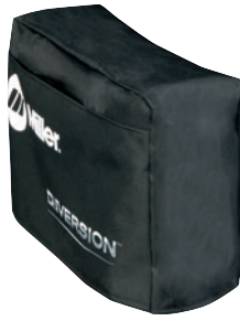
Protective Cover 300579

219259 For power cable 5-20P (120 V/20 A). Optional, not included with Diversion.