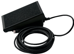
RFCS-RJ45 Remote Foot Control 300432

North/south rotary-motion fingertip current and contactor control attaches to TIG torch using two hook-and-loop fasteners. Great for applications that require a finer amperage control. Includes 13.25-foot (4 m) cord with plug.