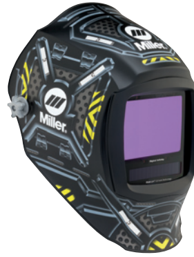
Black Ops™ 289715