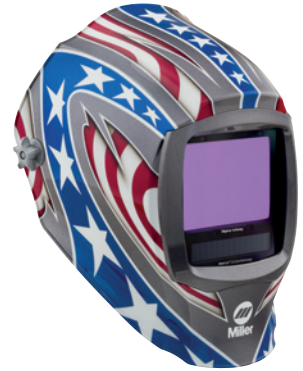
Stars and Stripes™ 288420