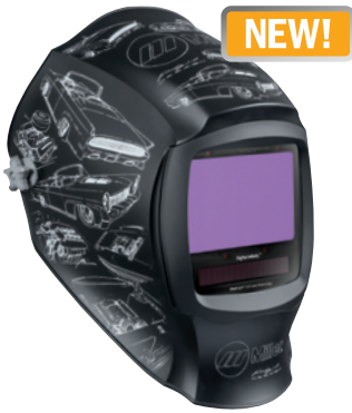
'22 Custom Kindig-it 292933