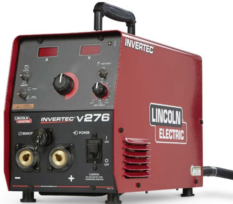
Shown: K4868-2 Invertec® V276

The Invertec V276 stick and TIG power source is ideal for outdoor construction applications. This small package delivers outstanding performance on a wide range of electrode types and sizes. Plus it is built rugged enough to handle the toughest construction sites.