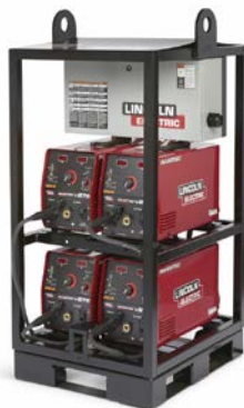
K4869-1 Invertec V276 4-Pack Rack