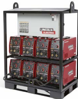
K4869-2 Invertec V276 8-Pack Rack