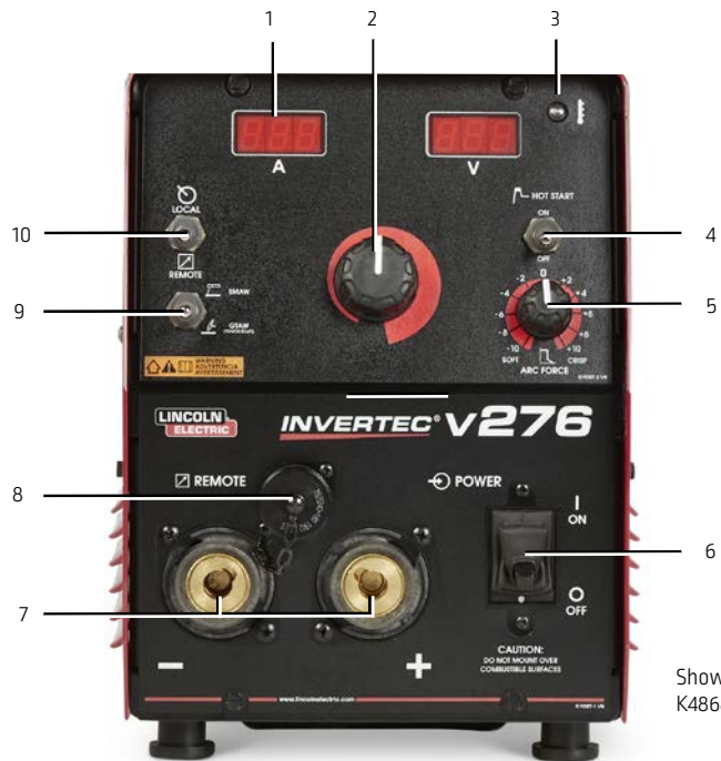
Shown: K4868-2 Invertec® V276