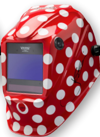
Jessi the Welder™ K4437-4