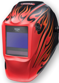
Street Rod® K3035-4