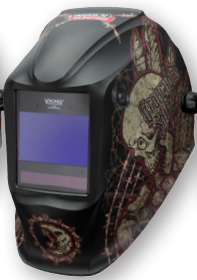
Graveyard Shift® K3099-4