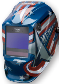
All American® K3174-4