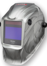
Heavy Metal® K3029-4