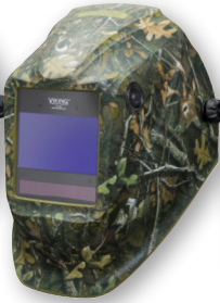
White Tail Camo™ K4411-4