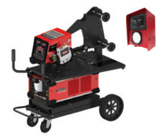
(K5440-1) Power Feed 84- Single Cool Arc 55S