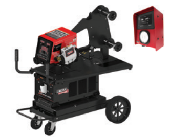
[K5440-3] Power Feed 84- Single Cool Wave 20S