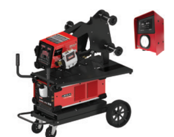
(K5440-2) Power Feed 84- Dual Cool Arc 55S