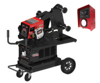
(K5440-4) Power Feed 84-Dual Cool Wave 20S

Not shown in image, Magnum PRO Water Cooled Gun