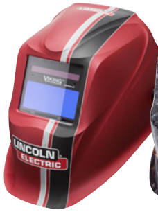
VIKING™ 1740 ReCode™ K3495-3