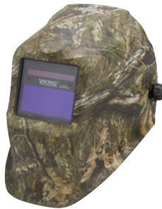
VIKING™ MOSSY OAK K5241-3