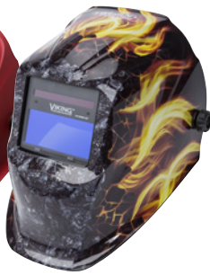
VIKING™ 1740 Ignition™ K4375-3