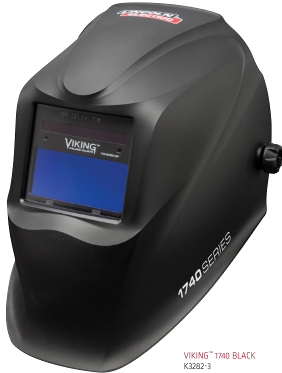
VIKING™ 1740 BLACK K3282-3