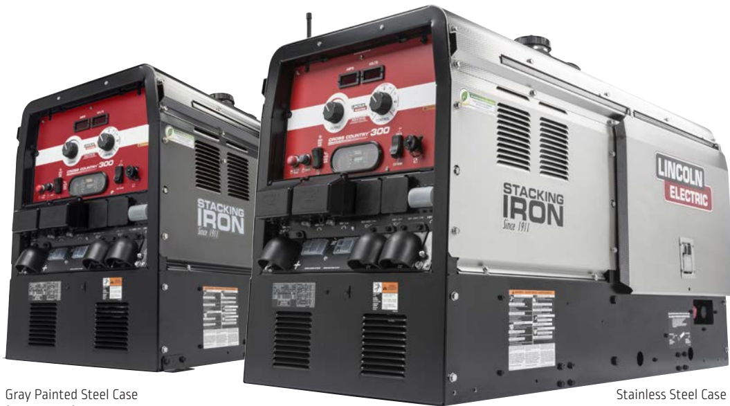
Gray Painted Steel Case [Base Model] K4166-1

It all comes in a compact, lightweight package that will fit into any truck bed and give you plenty of visibility through the rear window.