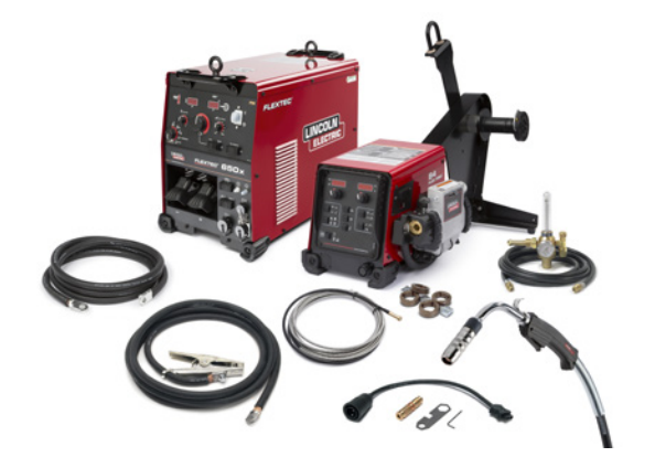
K3514-1 Flextec 650X/Flex Feed 84 Heavy Duty One-Pak®

Note: Ready-Pak all components including undercarriage are assembled and shipped on one pallet. One-Pak all components are shipped together on one pallet. User must assemble components.