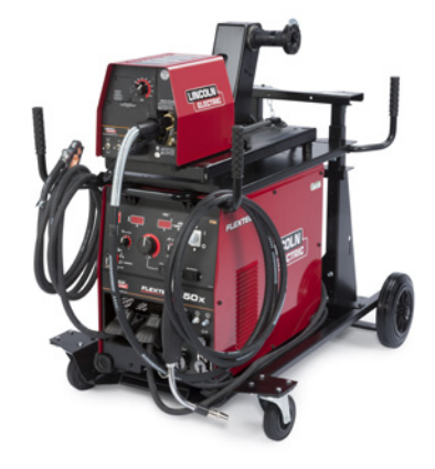
K3512-1 Flextec 650X/LF-74 Heavy Duty Ready-Pak®