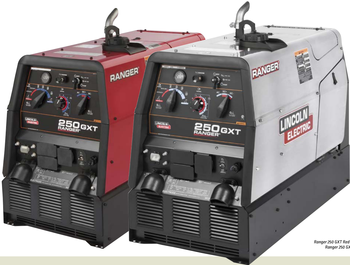
Shown: Ranger 250 GXT Red Paint [K2382-4] and Ranger 250 GXT Stainless [2382-5]