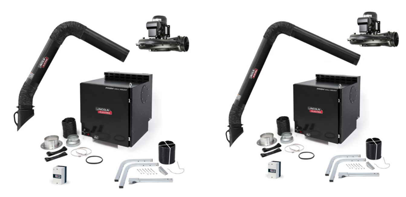
Shown: K4468-1 One-Pak Package