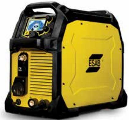
Rebel EMP 285ic