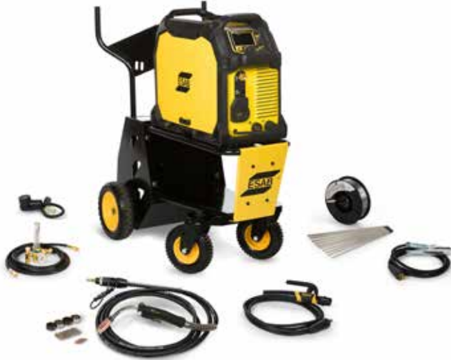
Rebel EMP 285ic with cart and accessories.