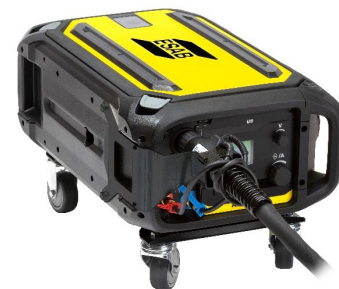
Wheel Kit and Strain Relief works with feeder horizontal or vertical