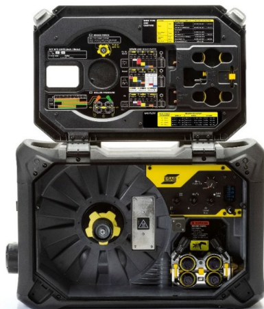
Internal LED lights and intergrated storage for wear parts in lid