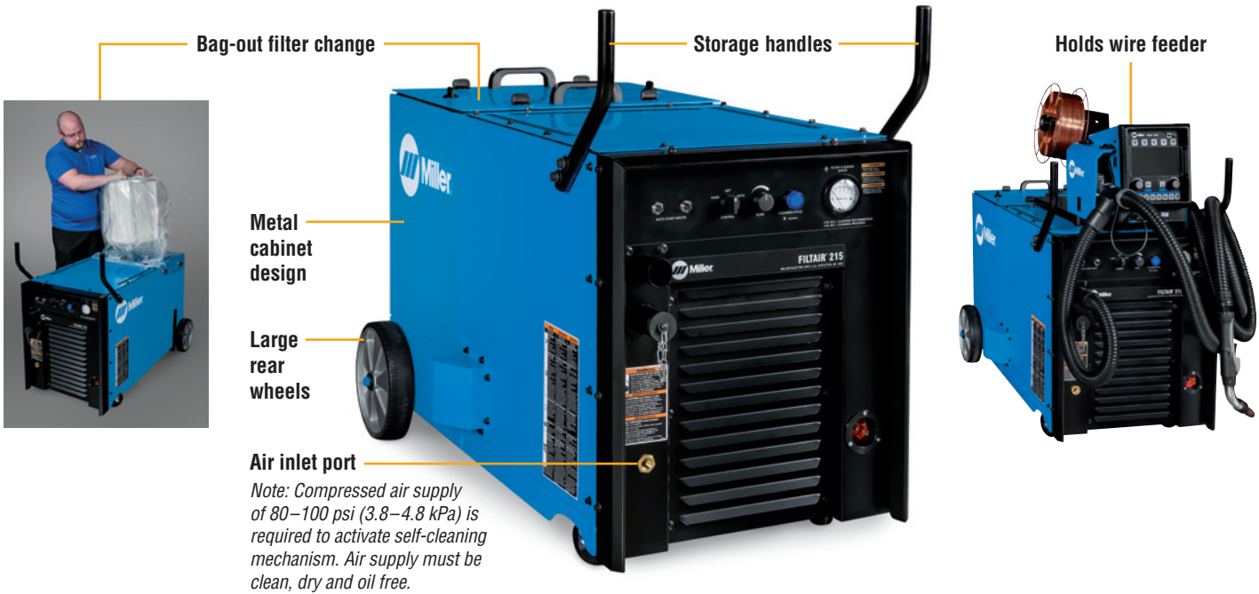
Filter cleaning gauge

Air inlet port Note: Compressed air supply of 80–100 psi (3.8–4.8 kPa) is required to activate self-cleaning mechanism. Air supply must be clean, dry and oil free.