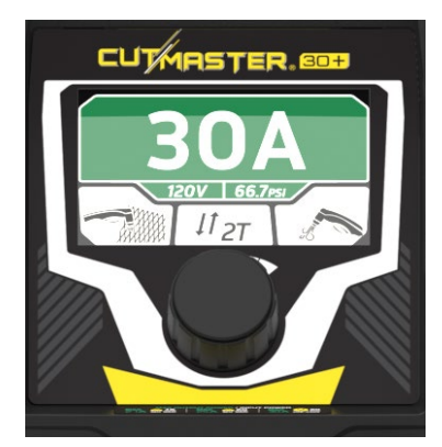
Simple and intuitive TFT LCD panel

Cutmaster 30+ is the perfect combination of power and portability for hand-held plasma cutting machine. Plus means more, so we've added a user-friendly 4.3 in. TFT LCD screen and upgraded features that give you even more control and flexibility to master any cut up to 10 mm (3/8 in.). Together with the SL60 1Torch, it all adds up to the total plasma cutting package.