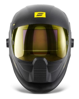
Compact shell with optional ambercolored protective outer lens.