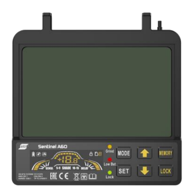
Advanced CE 1/1/1/1 ADF technology with a simple interface and clear graphic display.