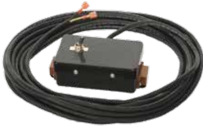
Remote Hand Switch