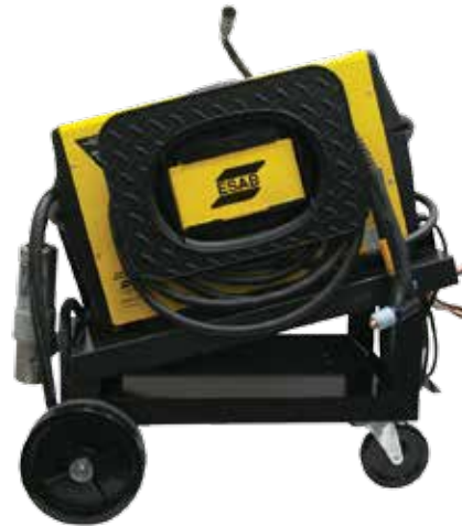
Utility Cart for PowerCut Series