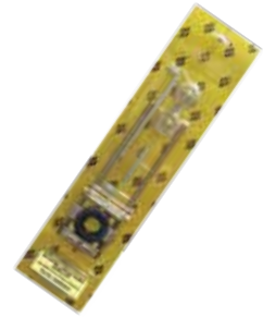
Basic Torch Guide Kit