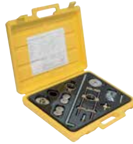
Deluxe Torch Guide Kit